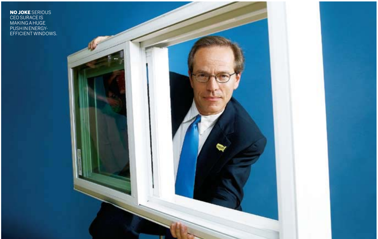
NO JOKE SERIOUS CEO SURACE IS MAKING A HUGE PUSH IN ENERGY-EFFICIENT WINDOWS.

PRODUCED EXCLUSIVELY BY FORTUNE CUSTOM REPRINTS. © 2009 TIME INC. ALL RIGHTS RESERVED.